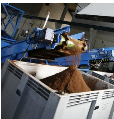
Capsule recycling: separating the coffee grounds from the aluminium

Having used the LCA approach since 2005, Nespresso has put robust systems in place to measure and report on the environmental impact of the parts of our business we manage directly. Now we are focused on gaining a better understanding of our environmental performance in other areas. For