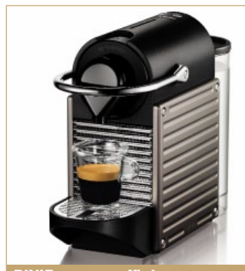
PIXIE: energy efficiency rating two levels better than "A" rating ***

example, we are working with Quantis on a project to measure the qualitative and quantitative effects of TASQ<sup>TM</sup>, our sustainability self-assessment tool for coffee farmers. TASQ<sup>TM</sup> includes criteria such as wastewater management and coffee replanting.