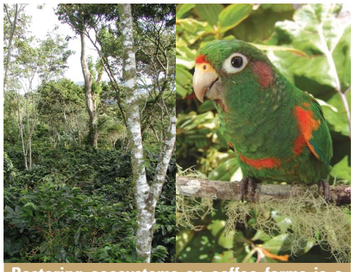
Restoring ecosystems on coffee farms is a key part of the AAA Program.