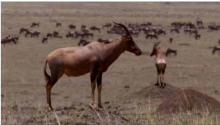
Funny Talking Antelopes IUCN Love not Loss