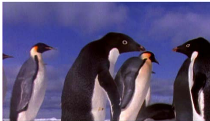
Funny Talking Penguins IUCN Love not Loss