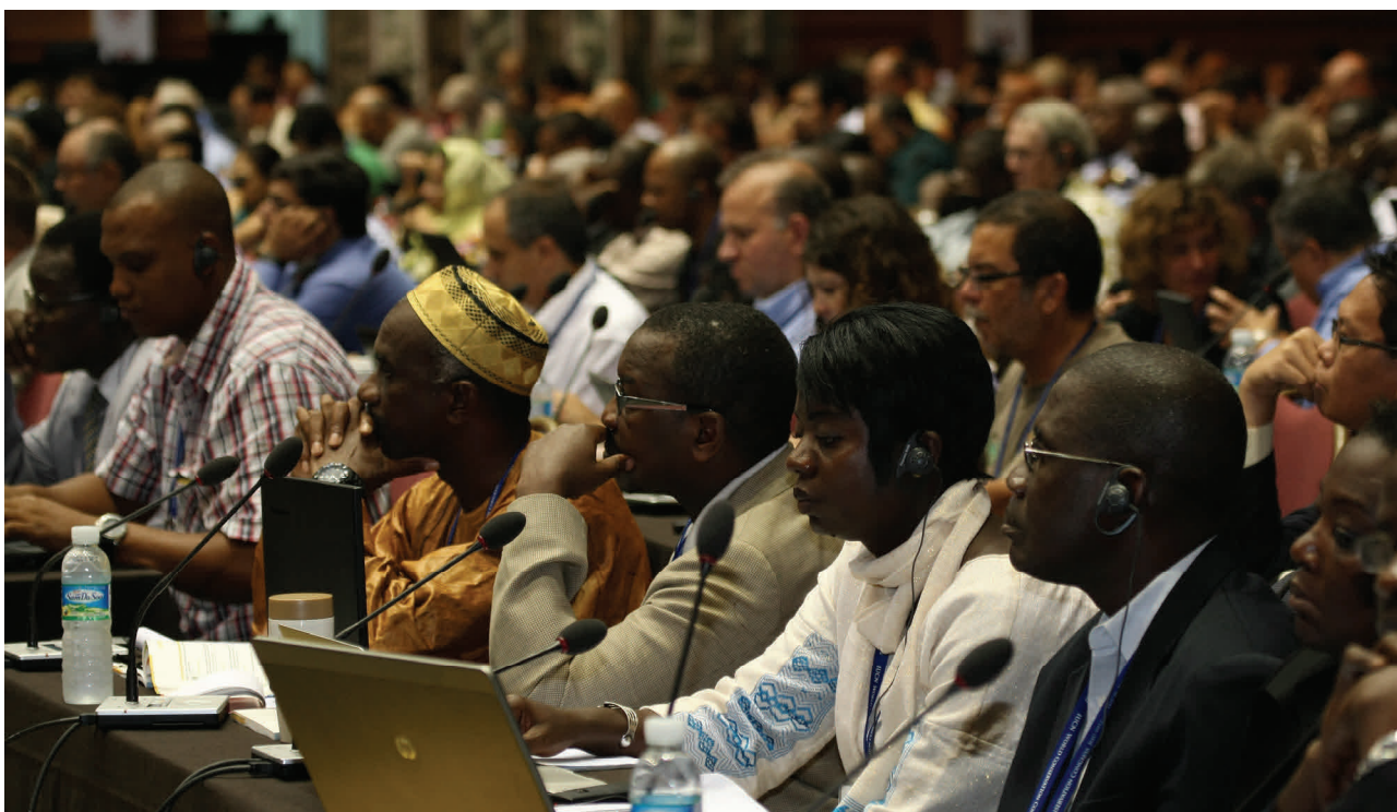
IUCN's government and NGO members jointly debate and vote on key conservation issues