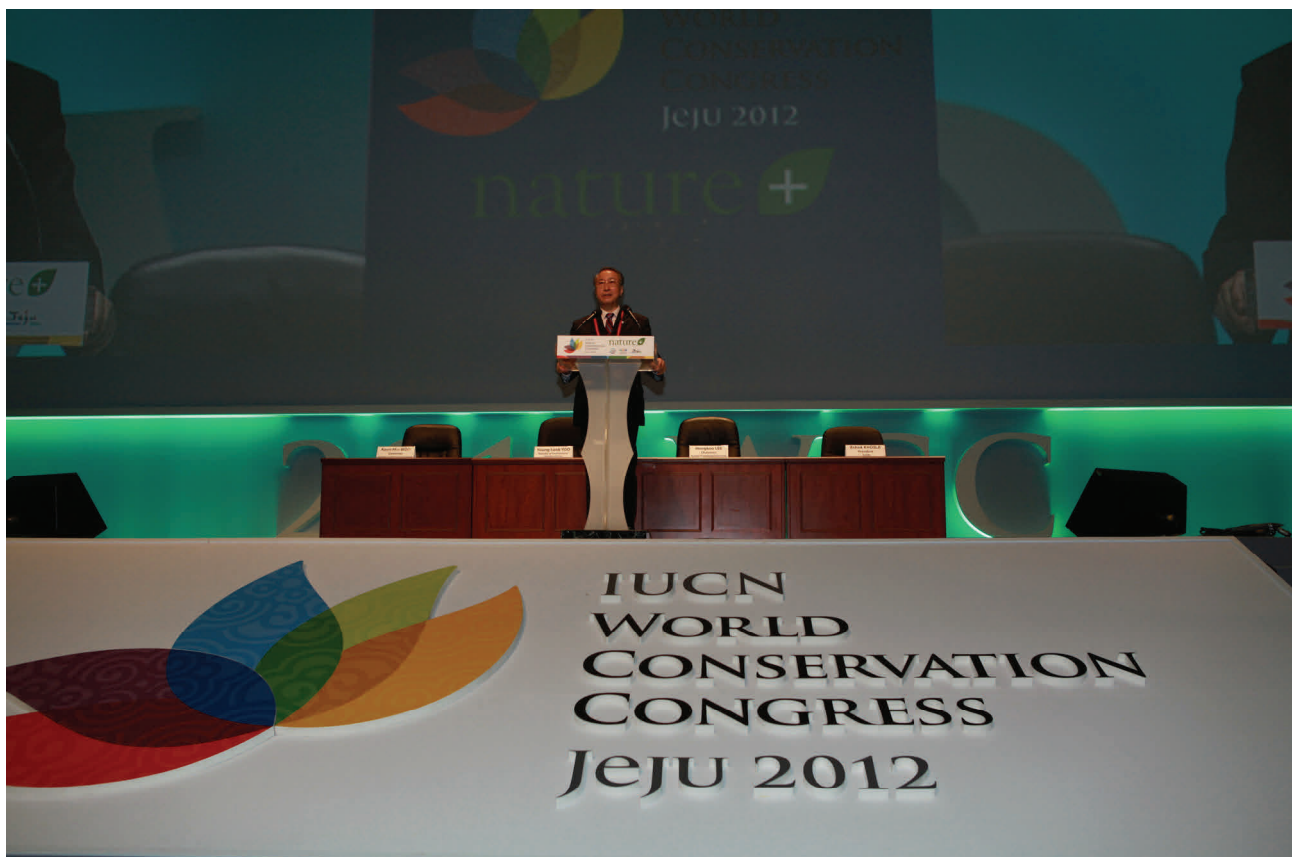
IUCN President-elect Zhang Xinsheng addressing the 2012 Jeju Congress closing ceremony