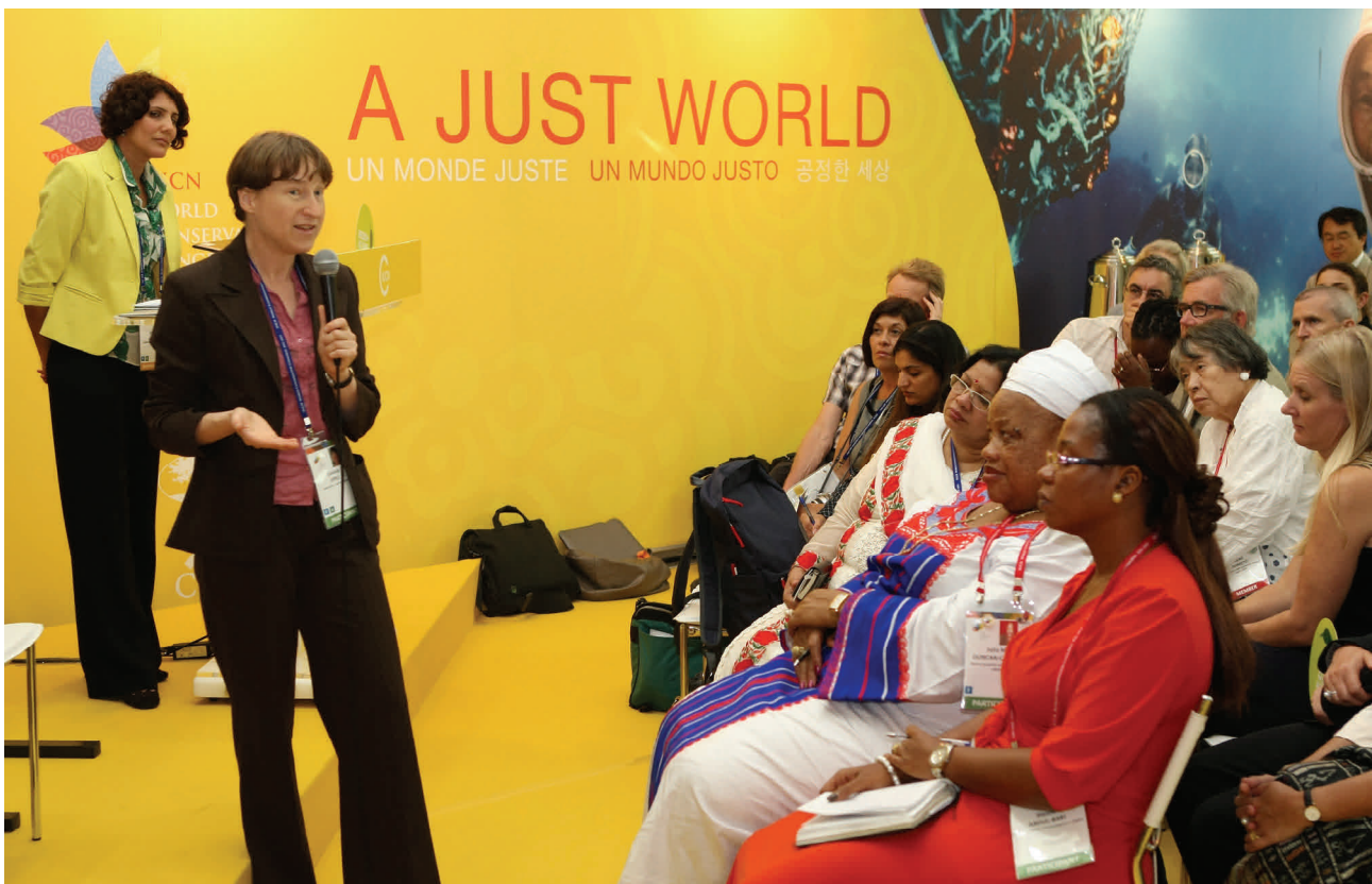
Participants at a session held in the Just World Pavilion at the 2012 IUCN World Conservation Congress