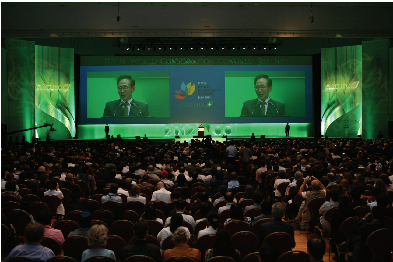
President of the Republic of Korea, HE Lee Myung-Bak, addressing the 2012 IUCN World Conservation Congress