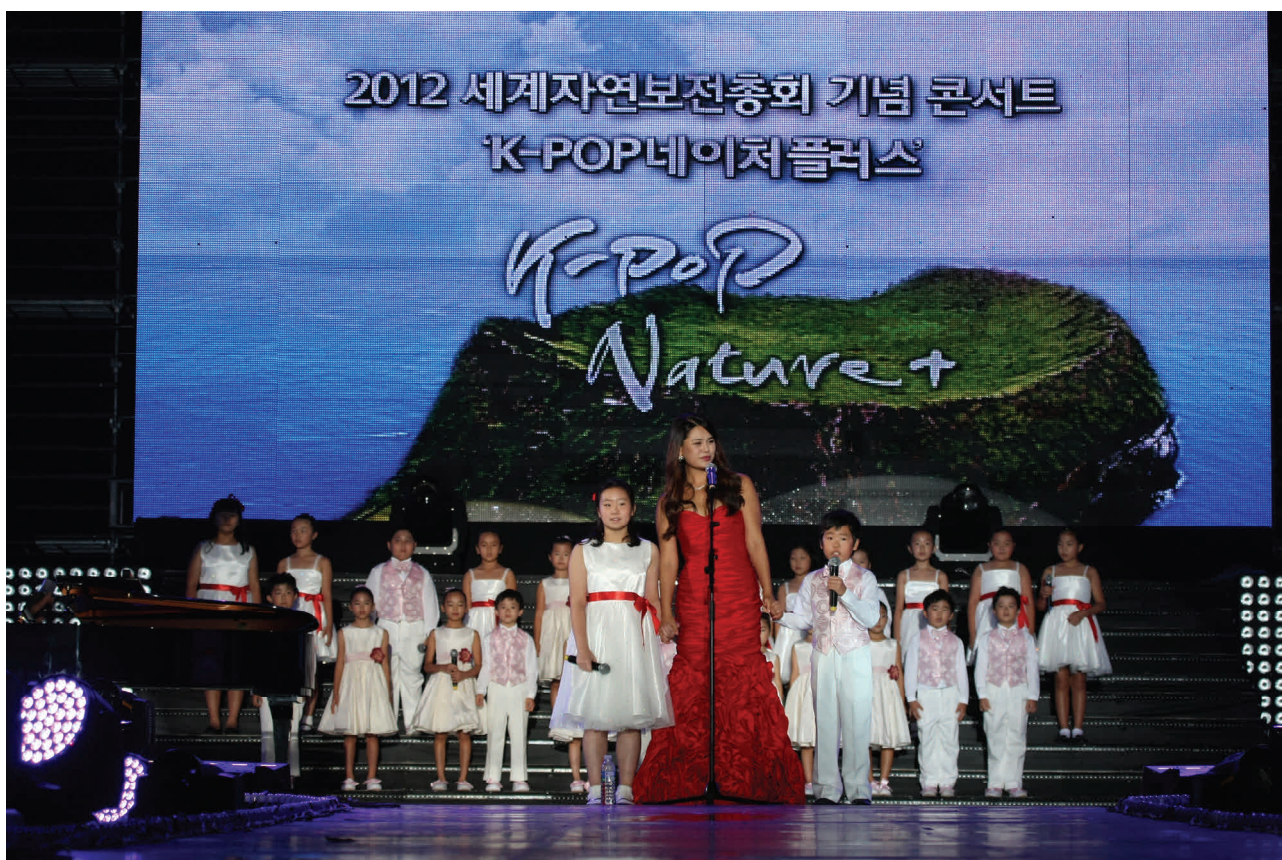
Nature+ K-Pop concert held during the Congress included performances by Korean and international musicians

Achim Steiner, Executive Director, United Nations Environment Programme and former IUCN Director General